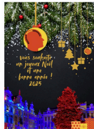
Photo: Grand-Place de Bruxelles décembre 2024

Nous continuerons à travailler, à collaborer à la recherche et aux bonnes pratiques qui favorisent la santé mentale et cérébrale.